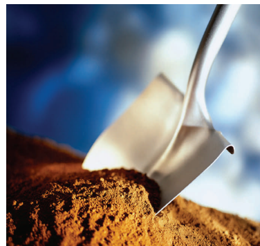
Groundbreaking Ceremony September 18, 2009 9:00 a.m.